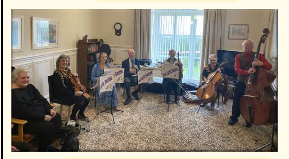
On Monday 18th March, Lyric Rag came to perform to the Sisters in Celebration of St Patrick's Day. It was a beautiful afternoon of music and laughter.